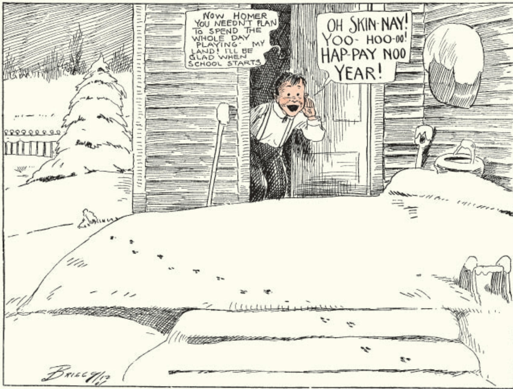
New Year's Morning